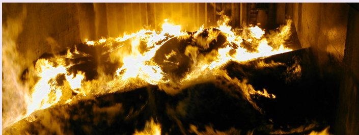
DRI which has self heated

Corrosion can be caused by some Group B cargoes and their residues. A coating or barrier may need to be applied to the cargo space structures before loading. Before loading and unloading corrosive cargoes, make sure the cargo space is clean and dry.