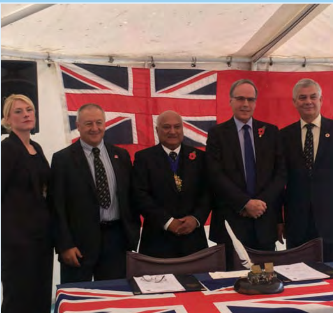
The team behind the Chartership project

The Nautical Institute will process the application through a dedicated sub-committee that has been specifically set up for the task,