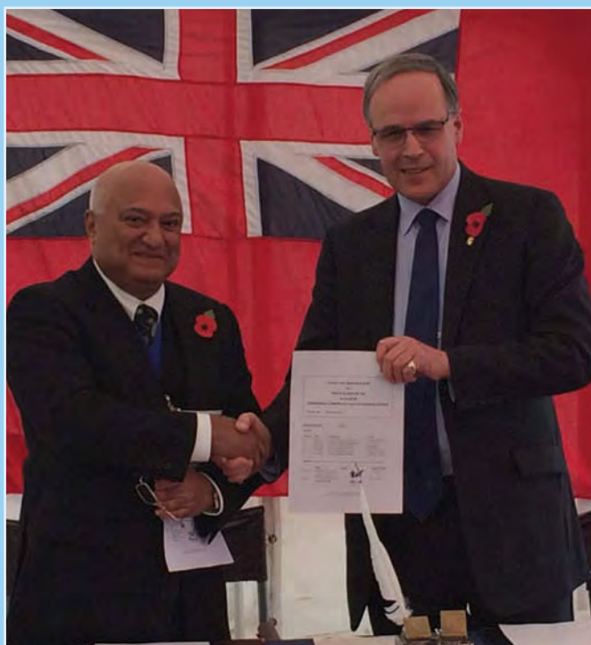
Signing the agreement