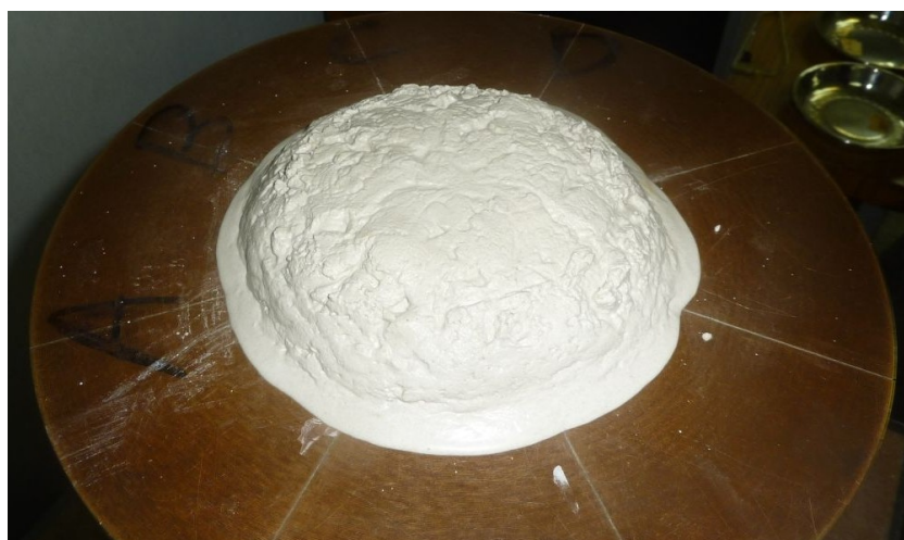
Liquefaction of Flootation Chemical Grade Barites above the Flow Moisture Point (FMP)

reference was made to the product having a moisture content of 6.6% and a Transportable Moisture Limit (TML) of 6.86%. This signified that the "Flootation Chemical Grade Barite" was a Group A cargo as it is not possible to obtain a TML in the case of Group C cargoes. However, the test for moisture content had not been carried out within 7 days of loading, contrary to the requirements of the IMSBC Code.