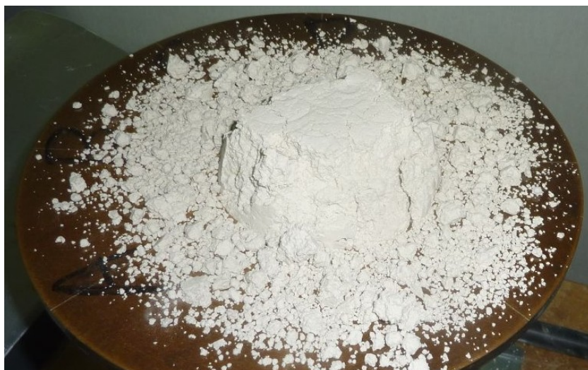
Collapse of Flootation Chemical Grade Barites below the Flow Moisture Point (FMP)