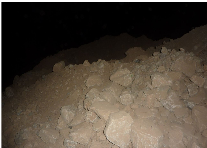
Drilling Grade Barites in Lump Form