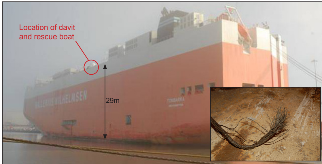
Vessel and parted fall wire

The 12mm diameter fall wire had a certified minimum breaking load of 141kN. Its safe working load (SWL) was 23.5kN based on a factor of safety of six. The wire was fitted to a single-arm davit (SA 1.5) ( Figure 2 ), manufactured by Umoe Schat-Harding Equipment AS (Schat-Harding). The davit system was powered by a Schat-Harding W50 two-speed electric winch with a nominal pull of 50kN.