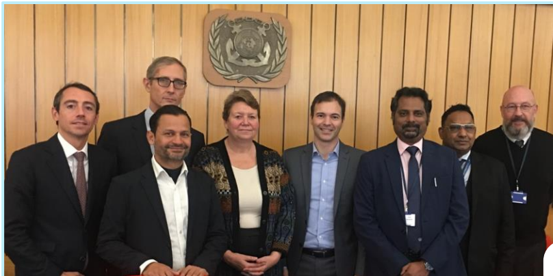
Recognised by IMO for pioneering blockchain in maritime

https://www.imo.org/en/About/Events/Pages/Blockchain-for-Maritime-Decisionmakers-.aspx